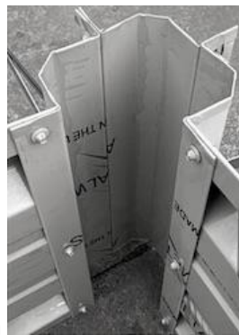
- Inside Corner